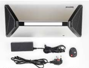
Each air purifier is equipped with an AC adapter, power cord and remote control

The above specification may subject to be changed without previous notice. For more detail: www.hkcapc.org